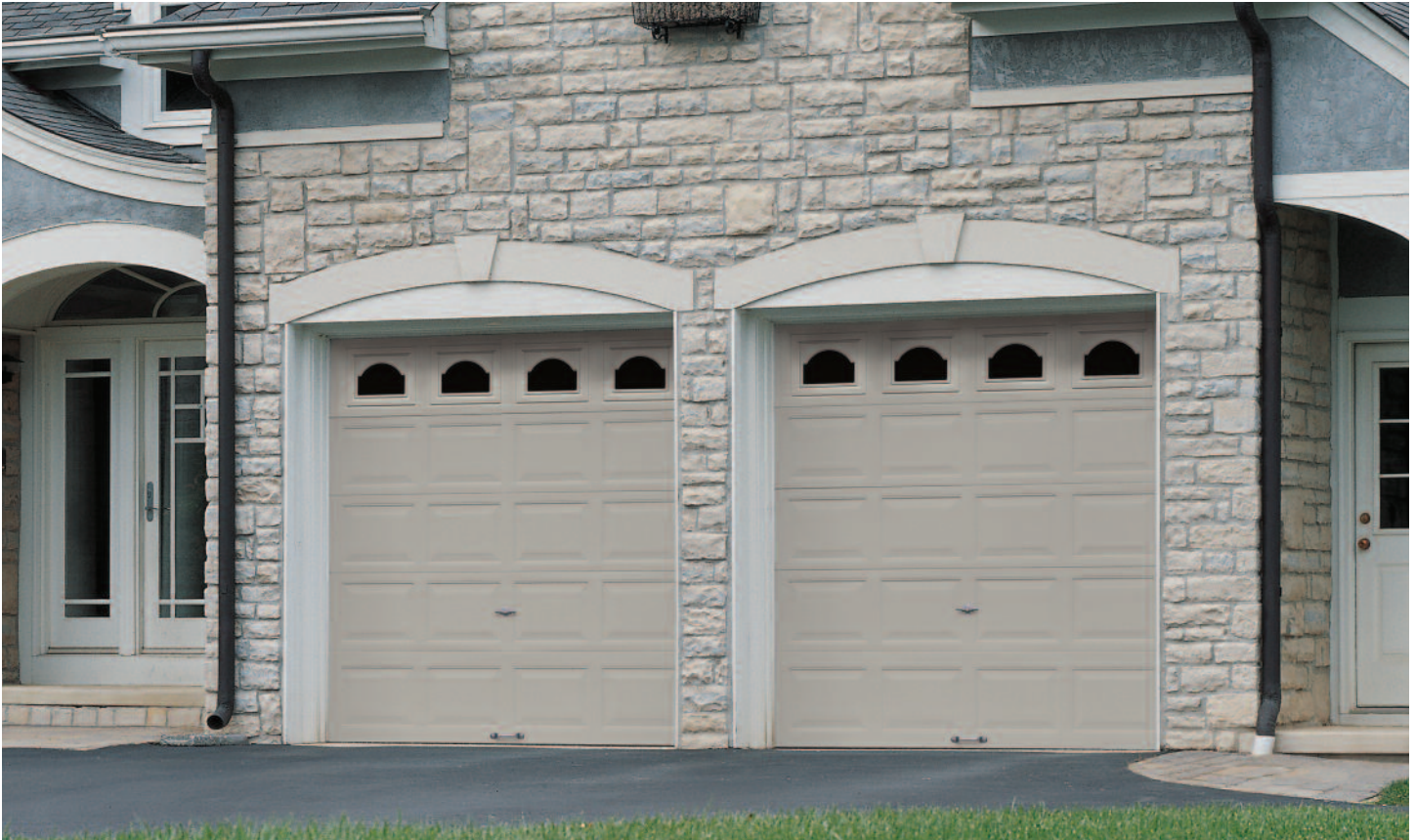
Model 8100 shown in Colonial design with Cathedral I window inserts